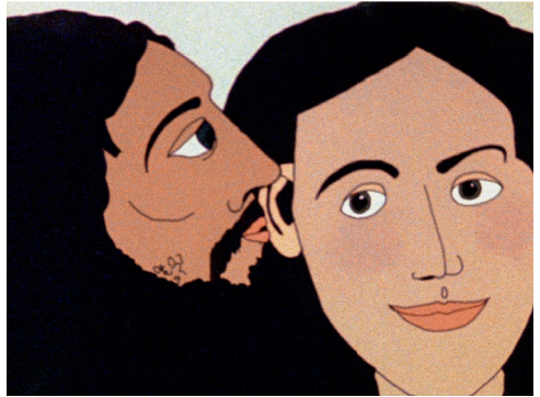
Desire Pie, 1976