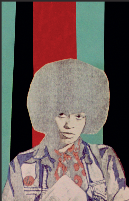
Hair Piece, 1975

New York Women in Film & Television (NYWIFT), the preeminent entertainment industry association for women in New York, advocates for equality in the moving image industry and supports women in every stage of their careers. Learn more at www.nywift.org